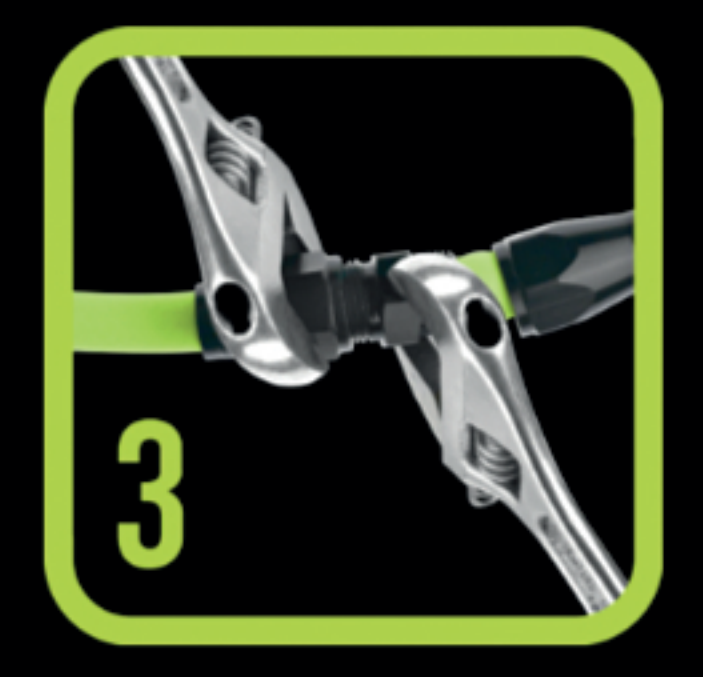
TIGHTEN – Tighten fitting nuts until snug.