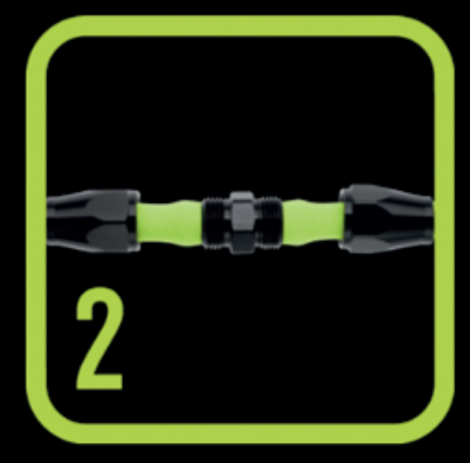
INSTALL – Slide hose onto fitting until hose reaches threads.