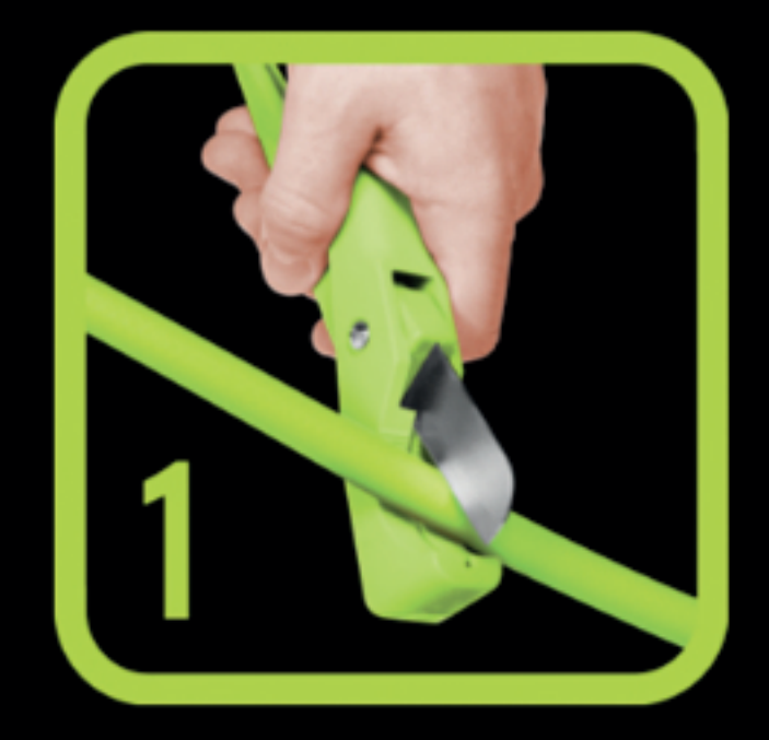
CUT – Measure and cut desired length of hose at 90° angle.