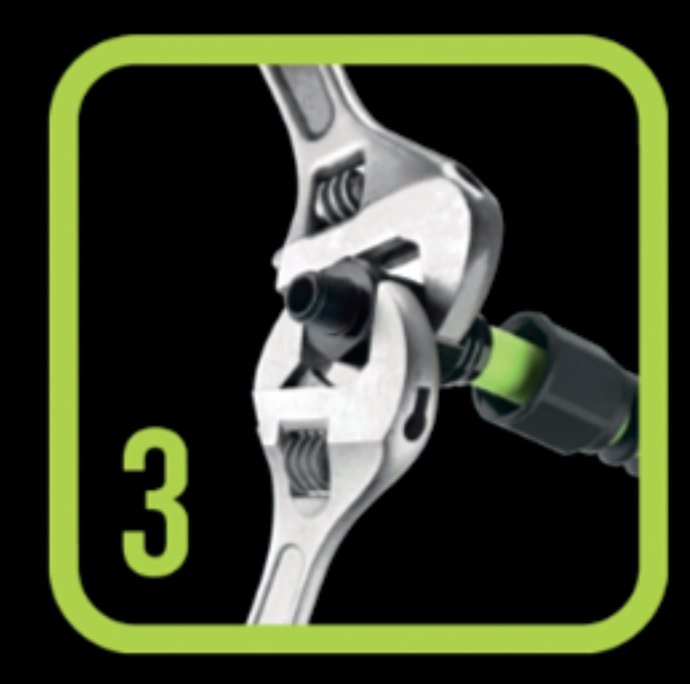
TIGHTEN – Tighten fitting nut until snug. Slide bend restrictor up and snap onto nut.