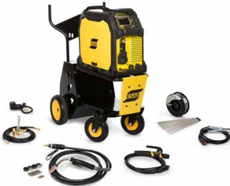
Rebel EMP 285ic with cart and accessories.