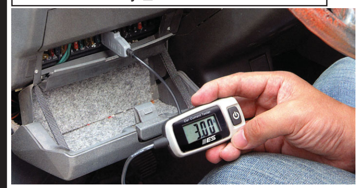
302M Fuse Buddy Tester in action