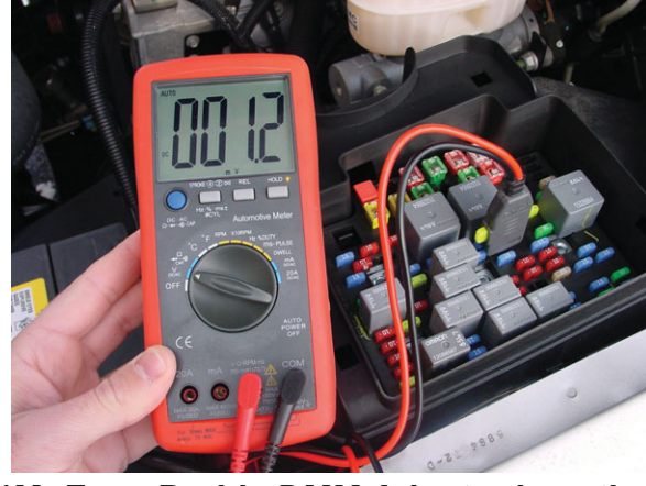
301M Fuse Buddy DMM Adapter in action