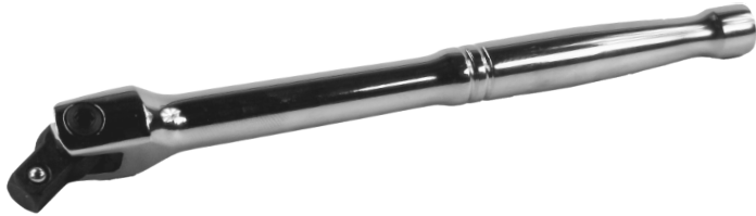
Breaker bar for holding the bottom, side or top of the crimper or cutter. Also can turn the head for cutting and crimping.