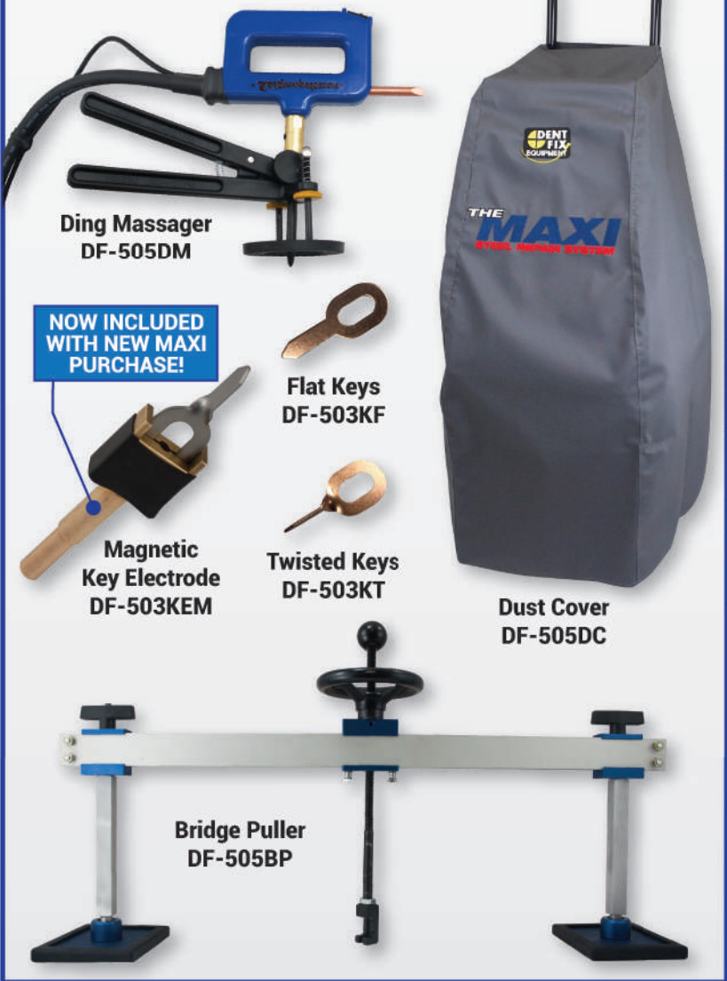
Ding Massager DF-505DM