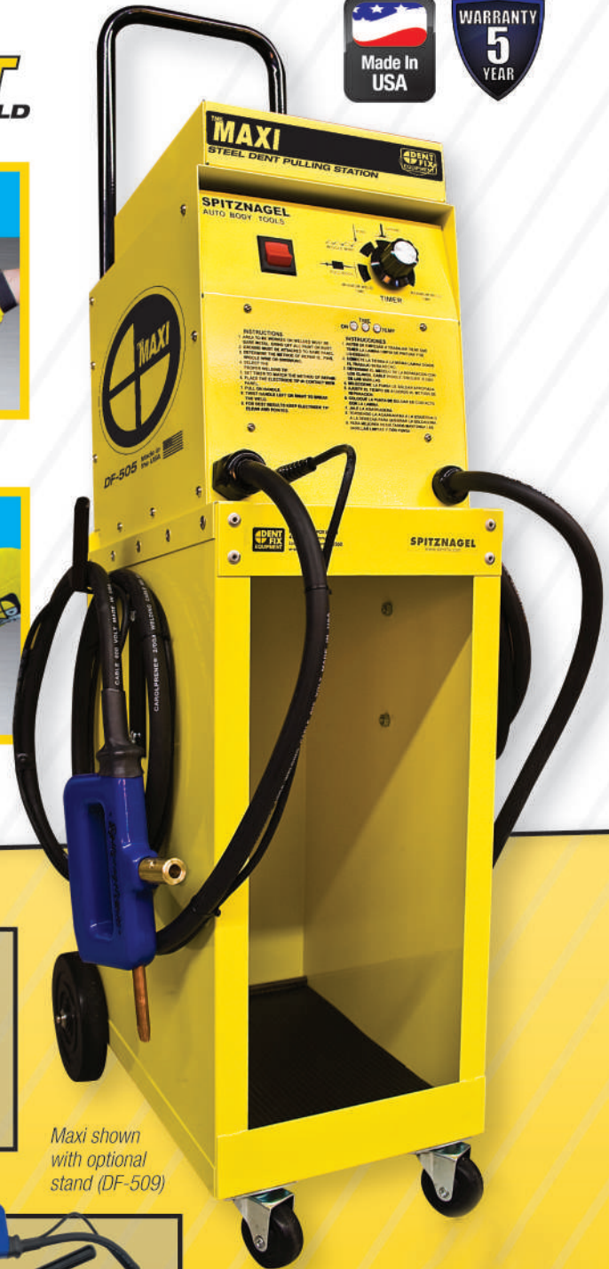
Maxi shown with optional stand (DF-509)