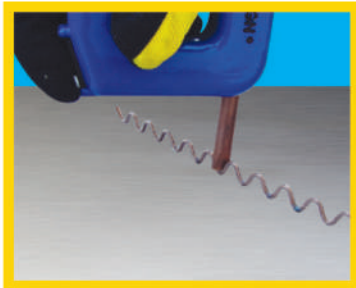
Wiggle Wire for Bear Claws