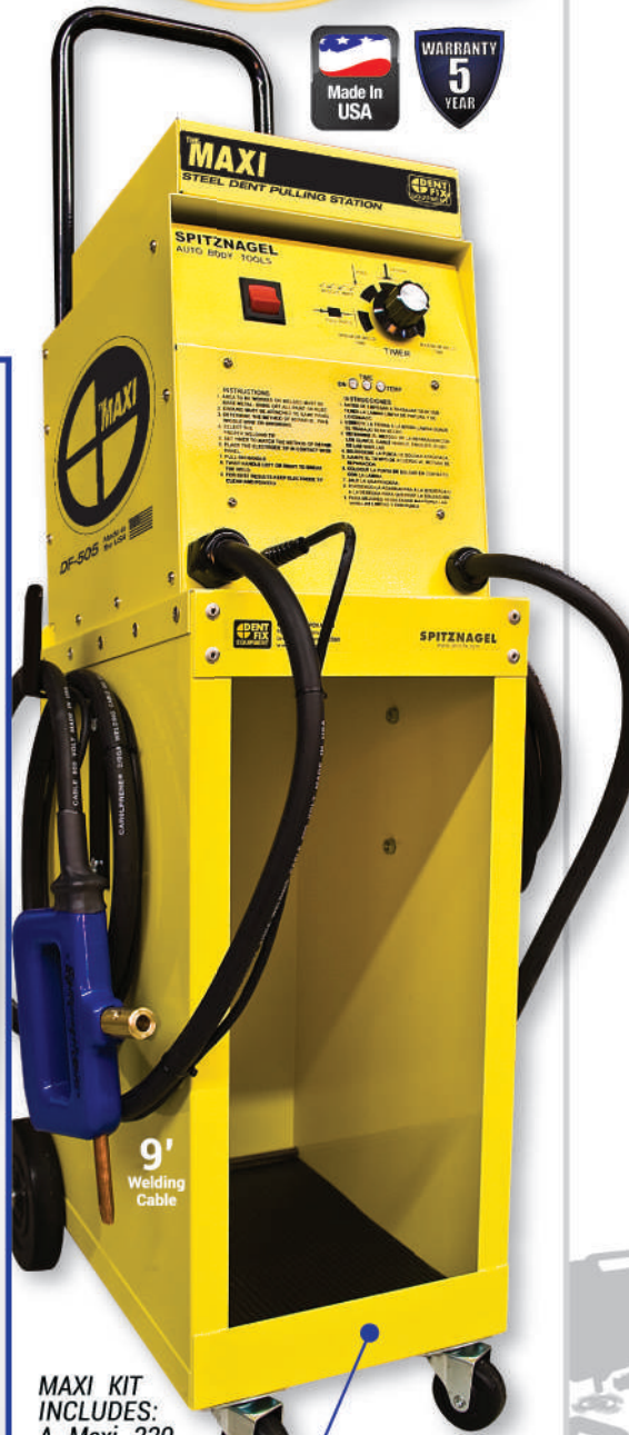
Bridge Puller DF-505BP

MAXI KIT INCLUDES: A Maxi 220 Volt Weld Unit, Leverage Puller, Two Bear Claws (9 Finger/4 Finger), 2 Light Pulling Rods, 2 Slide Hammer Rods with Strike Weight, Welding Electrodes (Key, Shrinking, Wiggle Wire, & Stud Pin), Sample Stud Weld Pins, and 1 Pound of Wiggle Wire.