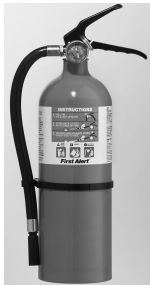
Heavy-Duty Fire Extinguisher Model FE3A10GR