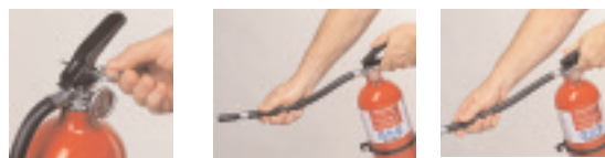
Break Seal and Pull Out the Safety Pin

This unit will not operate when it is on the mounting device. The extinguisher must be removed from the mounting device or it cannot discharge its contents to fight a fire.