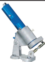
#12-169 (4) 1-3/4" Aluminum Swaged Handles