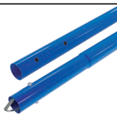
#82-519 (1) Bull Float Tote