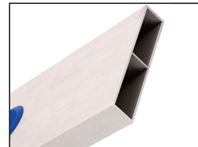
"H" style reinforcement for durability