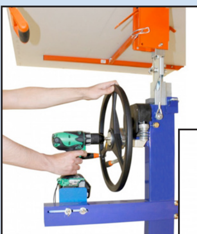
The only board lifter which can be used manually and automatically with the use of a power drill.