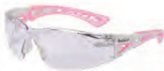
Available in Small Sizes

Rush+ is available in the clear lens PLATINUM® version with custom color matched temples. Minimum order 1300 pieces for Pantone color match. (L) Temple color (R) Frame color