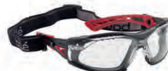
40293 Strap + Foam Kit Sold Separately