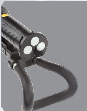
Three magnets on each end with spring-loaded gripper