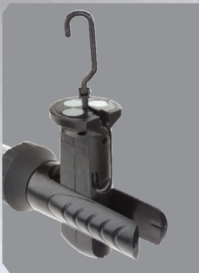
Each handle can independently rotate up or down