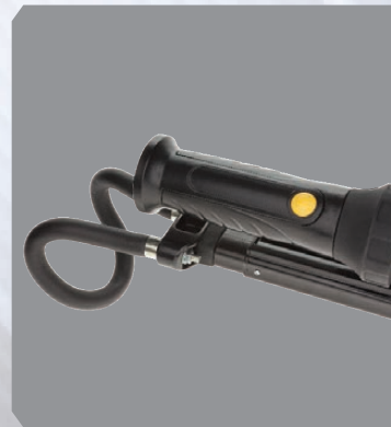
Dual on/off buttons operate in tandem on each handle