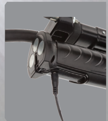
Recharges in 6 hours