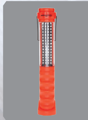
Flat bottom base