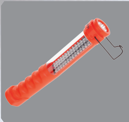
Integrated hook/prop stand