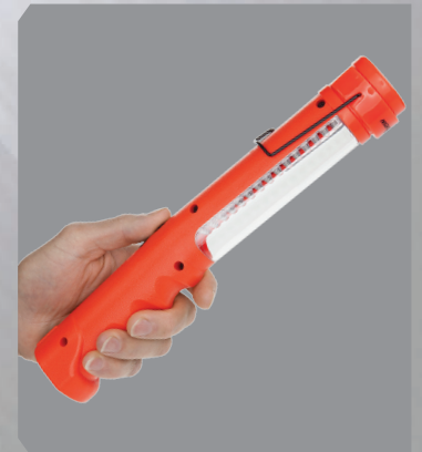
Ergonomic shape handle