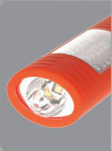
High-efficiency deep parabolic reflector (1224)