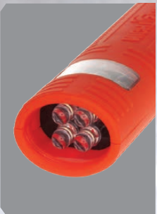
Four bright LEDs (1206)