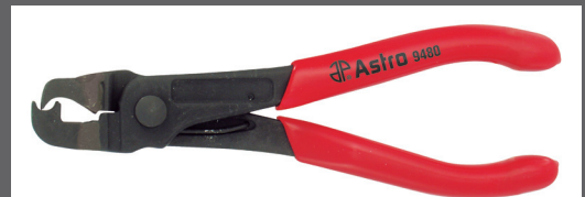
#9480 Door Skin Starter Pliers