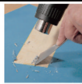
REMOVAL OF PAINT