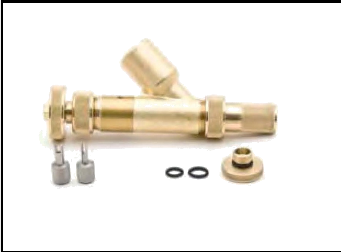
Model 15096 Calcium Ejector Gun