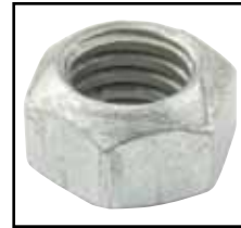
Mech. Lock Nut