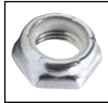
Thin Nylon Insert