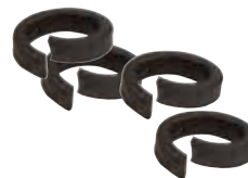
Lock For SHCS