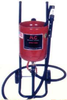
40000 Deadman Blaster (F-45DM) • Overall Height: 35" with 6" wheels • 44 lbs. / Ships UPS