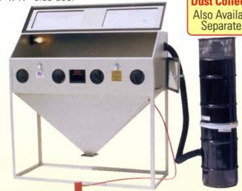
40413 Steel Blaster Cabinet