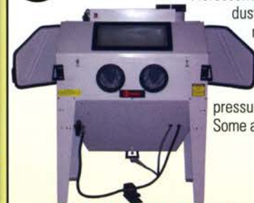
41500 Triple Door Blast Cabinet (2 side / 1 full top)

Florescent light, foot pedal, dust collector, extra nozzles / window and light underlayments included, and pressure regulator. Some assembly required.