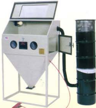
40403 Steel Blaster Cabinet

41412 Dust Collector Also Available Separately