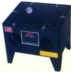
40389 Benchtop Cabinet Blaster