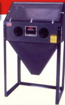
40391 Floor Model Cabinet Blaster