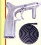
40015 Portable Blaster