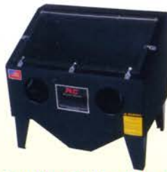
40390 Benchtop Cabinet Blaster