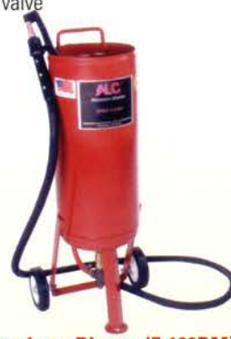
40002 Deadman Blaster (F-100DM) • Overall Height: 34" with 6" wheels • 53 lbs. / Ships UPS