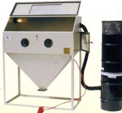
40411 Steel Blaster Cabinet