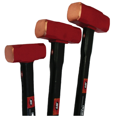
Copper Head Hammers