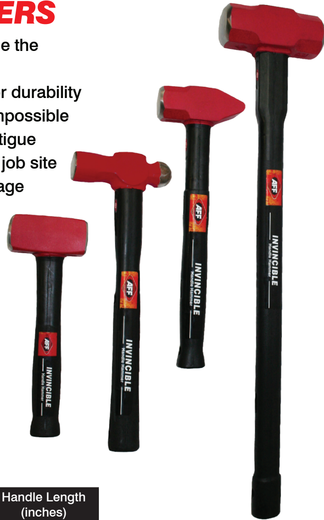
Textured rubber grip