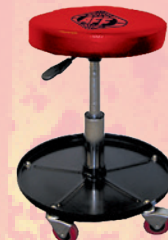
Model 3907 Air Piston Creeper Seat

Rely only on high-grade garage accessories offered on our virtual shelves.