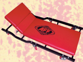
Model 3908 42" Mechanics Creeper