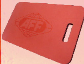
Model 3901 Power Mat