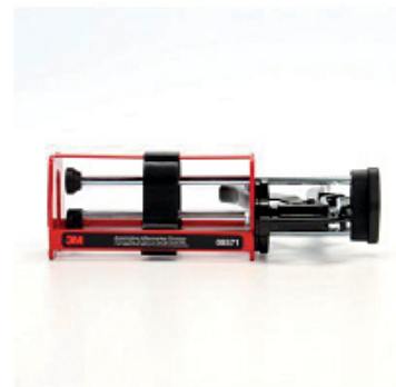
3M™ Manual Gun driven for balanced product dispensing

We developed our 3M™ Standard, Performance and Premium Manual Applicators to help you get the most out of individual orders and other automotive adhesive jobs where being efficient can be the most difficult. Featuring smaller sizes, seamless use with 3M cartridges and easily replaceable components such as plungers and mixing nozzles, our manual applicators help technicians become more portable and more versatile without sacrificing quality of work. Our applicators are big part of the science that extends your capabilities.