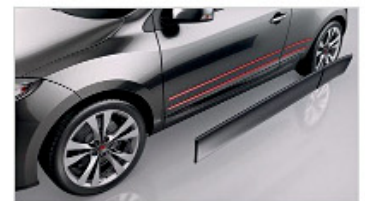
white closed-cell acrylic foam core with high performance adhesives on both sides