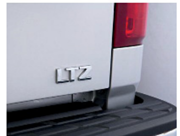
Flush fit of emblems, nameplates badges and other lightweight moldings and trim

Since 1925 when one of our lab assistants invented masking tape, 3M has been applying science to life — developing adhesive products and technologies that help entire industries and individual businesses worldwide. The work that began with a single 3M engineer now spans decades and generations — and all of it goes into each of our products developed for automotive OEM, like 3M™ Automotive Attachment Tape 06376.