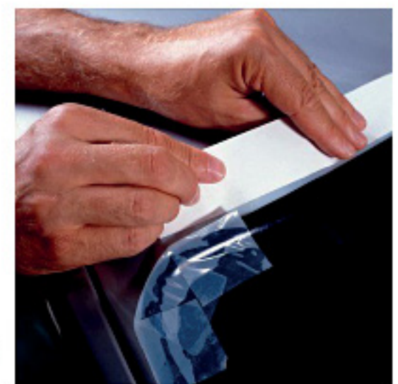
Translucent liner is removed while the tape is folded over and adhered