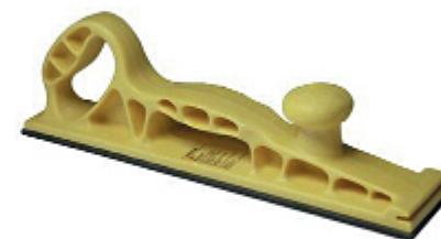
3M™ Hookit™ Hand File Board 05744

3M™ Hookit™ Hand Block is the perfect companion when using 3M™ Hookit™ abrasives. Our sanding block fits comfortably in the hand to reduce instances of hand fatigue. The block allows for a more even and consistent application of pressure, which delivers more uniform results. A sanding block also lets you apply more pressure than you could simply with your hand, a benefit that will speed how quickly you can complete your project.