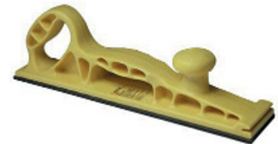
3M™ Hookit™ Hand File Board 05744

3M™ Hookit™ Hand Block is the perfect companion when using 3M™ Hookit™ abrasives. Our sanding block fits comfortably in the hand to reduce instances of hand fatigue. The block allows for a more even and consistent application of pressure, which delivers more uniform results. A sanding block also lets you apply more pressure than you could simply with your hand, a benefit that will speed how quickly you can complete your project.