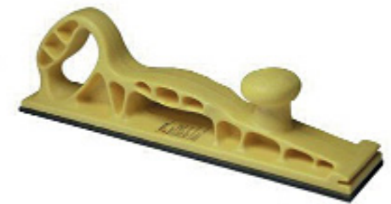
3M™ Hookit™ Hand File Board 05744

3M™ Hookit™ Hand Block is the perfect companion when using 3M™ Hookit™ abrasives. Our sanding block fits comfortably in the hand to reduce instances of hand fatigue. The block allows for a more even and consistent application of pressure, which delivers more uniform results. A sanding block also lets you apply more pressure than you could simply with your hand, a benefit that will speed how quickly you can complete your project.