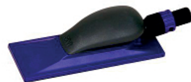
3M™ Hookit™ Sanding Block D/F, 05208

Our blocks make hand sanding a more efficient task, which helps boost overall productivity when power sanding is not an option. Automotive restoration technicians like power sanding due to its speed and ease, but some applications do not allow for power sanding. In those cases, you can still gain efficiency by using our sanding blocks. Use these blocks for areas out of reach of power sanding tools. Hand sanding is also preferred for situations in which you need more precise control. With the speed of power sanders, one lingering pause can result in irreversible damage in certain situations. Hand sanding allows you to work at a pace that's suitable for more delicate work. Hand sanding also produces less dust if that is a concern.