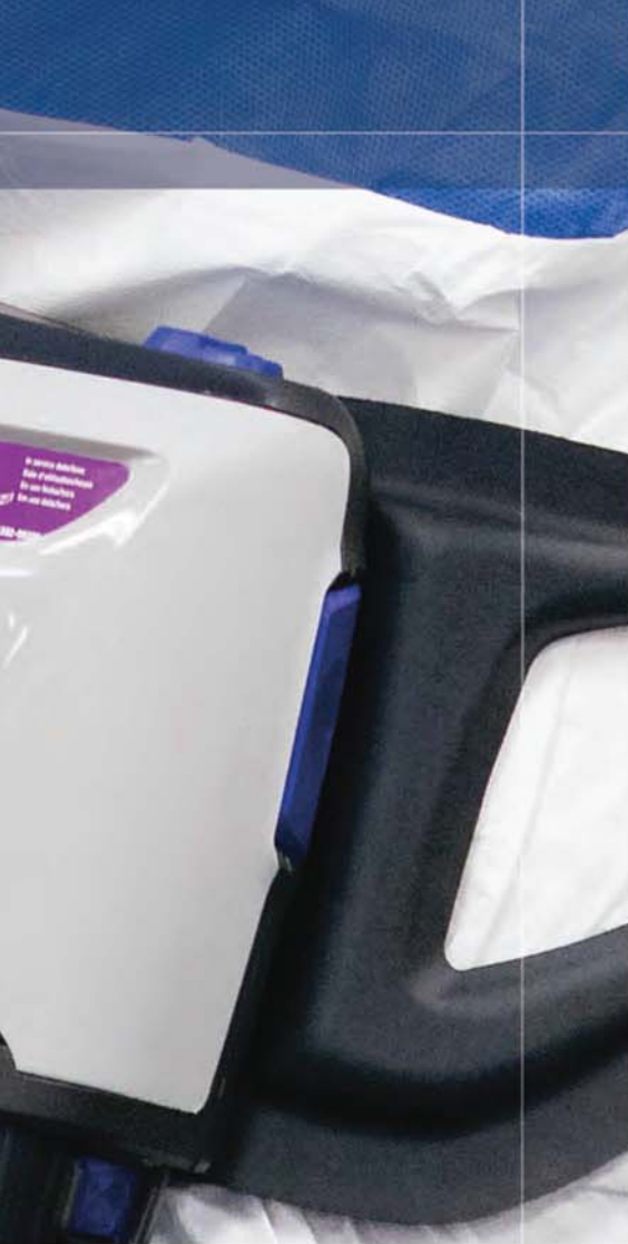
Image shown with optional integrated earmuffs and HE filter.

For rugged operations such as industrial, demolition, grinding, metal finishing and casting, the Heavy Industry Kit (TR-600-HIK) features M-307 Hard Hat Assembly Headtop, TR-6530N Combination Cartridge (HE/OV/AG), TR-632 High Capacity Battery