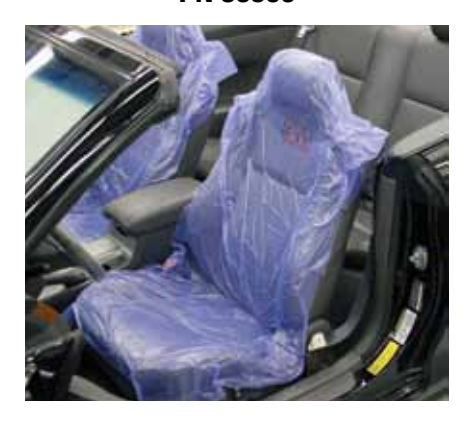
Top pocket keeps seat cover in place Gripping feature allows easy in and out