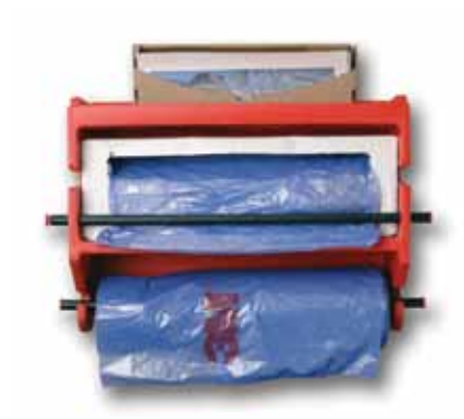
Wall Mount Interior Protection Product Dispenser