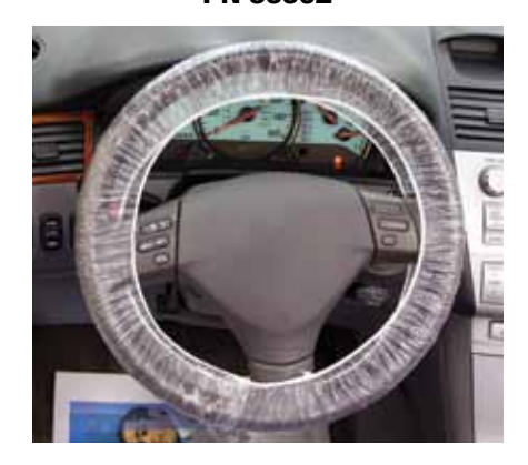
Elastic conforms to steering wheel Universal size fits all steering wheels