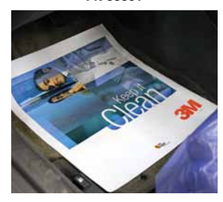
Heavy duty construction resists tearing Treated to resist moisture