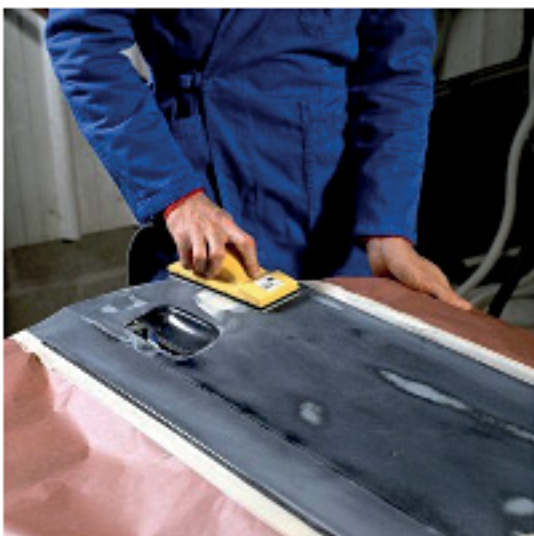
Ideal for achieving a true flat surface

Whether it's removing a scratch with a feather-edging technique, shaping filler, paint finishing, or primer sanding, we have the correct abrasive for your automotive job. This reduces, if not eliminates, the need to purchase other abrasives that won't last as long and may have a more limited range of uses. When working with automobile surfaces — especially cosmetic ones — it's essential to use precise and nimble abrasives that will get the job done without damaging surfaces. Our line of abrasives gives you the right tool for sanding or shaping one or more surfaces (depending on model) including — primer, clear coat, fiberglass, paint, or plastic filler.