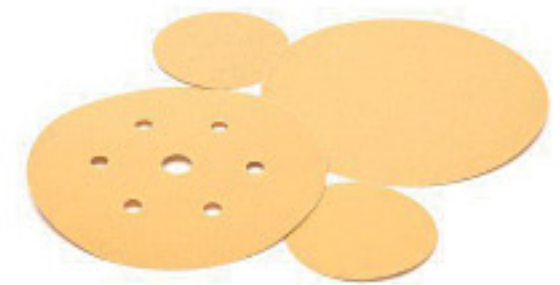
Discs are available in a variety of sizes and grits both with and without holes

A grade range from P80 to P180 along with durable C-weight paper backing make our 3M™ Hookit™ Gold Disc 236U ideal for auto body sanding projects including rough feather-edging, scratch refinement on bare metal, paint removal around damaged areas and more. With its open coat construction and aluminum oxide mineral abrasive, it provides a sharp cut — more aggressive than a comparable closed coat abrasive of the same grade — without dust accumulating on the disc. The Hookit™ Gold Disc 236U is available in 3- or 6-inch diameter sizes for substrates including clear coat, fiberglass, filler, metal, paint, plastic and putty.