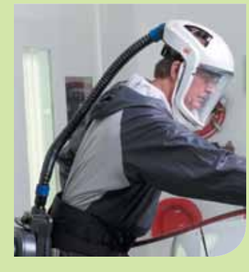
Eye and Face Protection