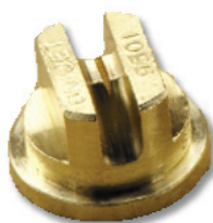
3M™ Cylinder Adhesive Spray Tip 9501

A unique, high output wide width spray pattern tip designed specifically for use with 3M™ HoldFast 70 and 3M™ Polystyrene Foam Insulation 78 HT Cylinder Spray Adhesives.