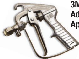
3M™ Cylinder Adhesive Applicator

Standard Output for use with any 3M™ Cylinder Spray adhesive products. Includes Cylinder Adhesive 9501 Spray Tip.