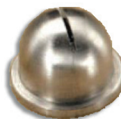
3M™ Cylinder Adhesive Spray Tip QSS

Standard Output for use with any 3M™ Cylinder Spray adhesive products. Includes Cylinder Adhesive 9501 Spray Tip.