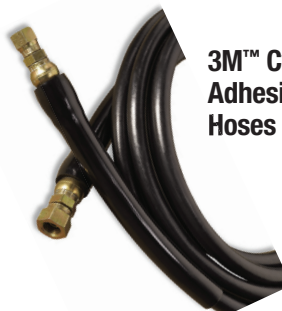
3M™ Cylinder Adhesive Hoses

A standard output, wide spray width tip.