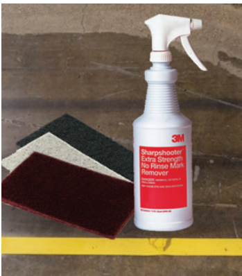
Scotch-Brite™ Hand Pad 7447.

Thin backing provides excellent abrasion resistance and withstands lifting from forklift traffic and dragging pallets. Vibrant color is locked into the backing for long-term visibility. Easy to apply and remove.