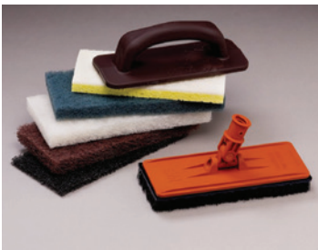
3M™ Doodlebug™ Pad Holders are versatile cleaning solutions.