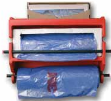
Wall Mount Interior Protection Product Dispenser